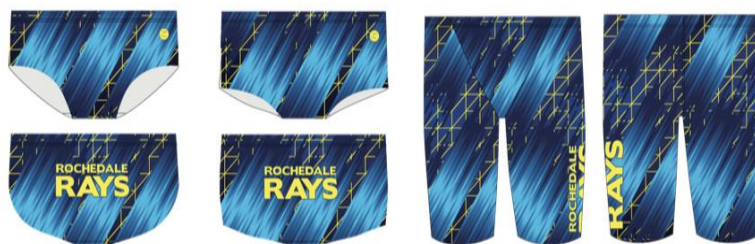
BBT - WIDESIDE BRIEF