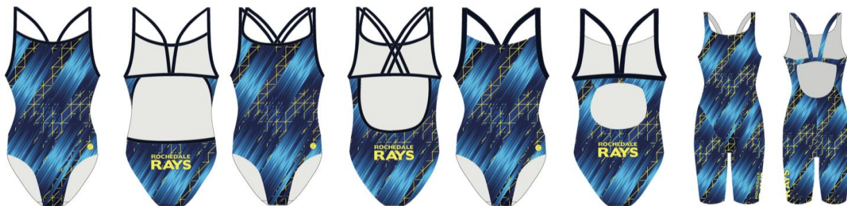
1PT - THIN STRAP ONE PIECE

All you have to do to "get your Rays on" is complete the order form, including the number of items, sizes and payment method. Once completed just email it to the Secretary at rrascsecretary@gmail.com or if you prefer you can bring it along on club night and drop it in to the canteen. Payments can be made by cash or bank deposit, [using surname as a reference]: Rays Club Account BSB:064170 Account No: 10689861